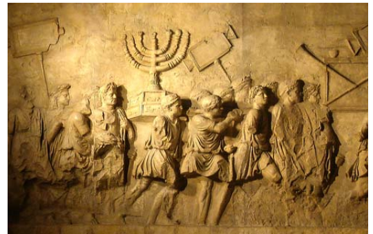
The Menorah in Rome’s Arch of Titus

That menorah is mentioned for the first time in today's parasha , when Elohim tells Moshe to “ You are to make a menorah of pure gold...It is to have six branches extending from its sides, three branches of the menorah on one side of it and three on the other. ” (Ex. 25:31-32) In reading the description of the Menorah, the details are so complex that it is easy to despair of ever visualizing it correctly. Fortunately, in our day, we have Wikipedia and Google coming to the rescue. Like the Menorah of old, we also can illumine the world. “ Likewise, when people light a lamp, they don't cover it with a bowl, but put it on a menorah, so that it shines for everyone in the house. In the same way, let your light shine before people, so that they may see the good things you do and praise your Father in heaven. ” (Matt. 5:15-16)