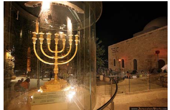
The Temple Menorah Displayed in Jerusalem

That menorah is mentioned for the first time in today's parasha , when Elohim tells Moshe to “ You are to make a menorah of pure gold...It is to have six branches extending from its sides, three branches of the menorah on one side of it and three on the other. ” (Ex. 25:31-32) In reading the description of the Menorah, the details are so complex that it is easy to despair of ever visualizing it correctly. Fortunately, in our day, we have Wikipedia and Google coming to the rescue. Like the Menorah of old, we also can illumine the world. “ Likewise, when people light a lamp, they don't cover it with a bowl, but put it on a menorah, so that it shines for everyone in the house. In the same way, let your light shine before people, so that they may see the good things you do and praise your Father in heaven. ” (Matt. 5:15-16)