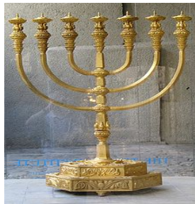
A reconstruction of the Menorah of the Temple

Everyone knows that the principal symbol of Judaism is the six-pointed Star of David. But did you know that the Magen David only became a Jewish symbol in the Middle Ages? Despite its prominence on the flag of Israel and kiddush cups, the Magen David is a rather late representative of Judaism and the Jewish People. For most of our history, and certainly in antiquity, the preeminent symbol of the Jewish religion was the Menorah , the seven-branched candlestick which was first revealed in the Tabernacle of Moses, and later in the Temple of King Solomon in Jerusalem. 1