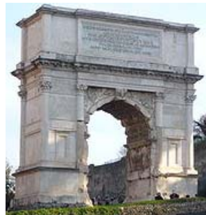
The Arch of Titus